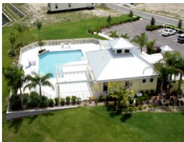
Bimini Bay's Clubhouse & Pool

This month, you may notice a wonderful addition to Bimini Bay's community pool: brand-